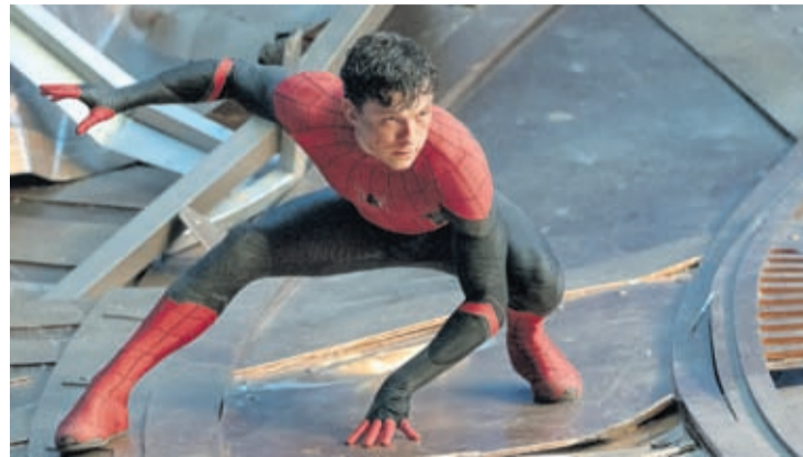
This image released by Sony Pictures shows Tom Holland in Columbia Pictures' "Spider-Man: No Way Home."